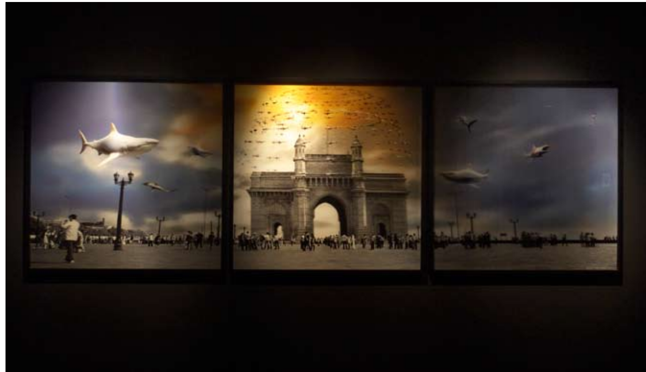
Monument, 3D rendering and photography on archival lenticular print media, 45” x 135” (triptych), 2011

Reality essentially is an epiphenomenon by virtue of it being an interpretation of sensory data filtered through cultural and gender bias, and virtual reality emerges as effervescence, an adjunct that is briskly modifying the