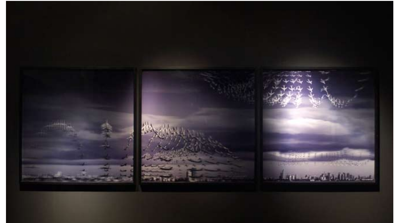
ELEVENTH HOUR CHORUS- 2, photography & 3d rendering, 3d lenticular print , 45” x 135” (triptych), 2010