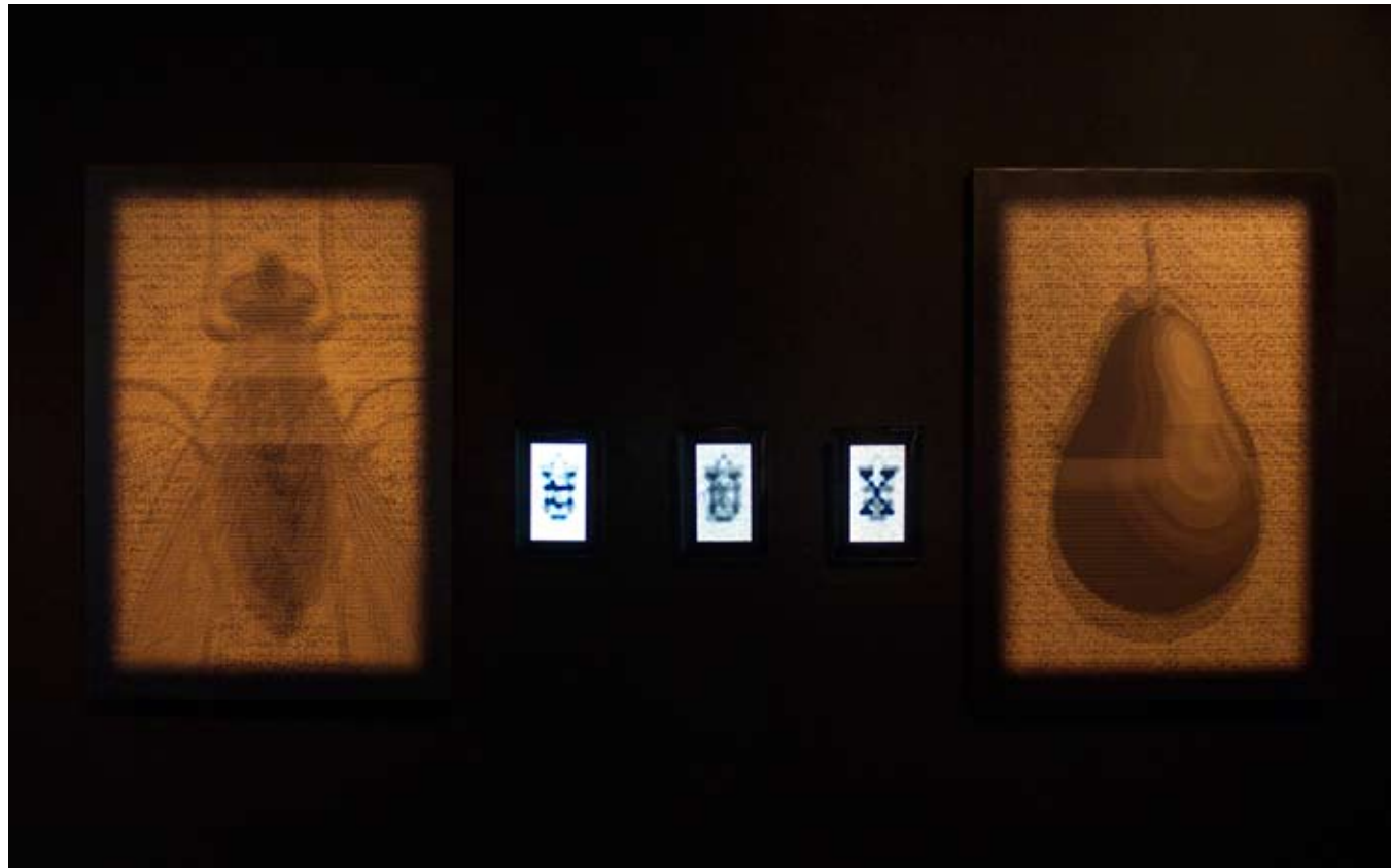
Drag, installation - solvent prints on vinyl, gif animations on LCD screens, dimensions variable, 2011