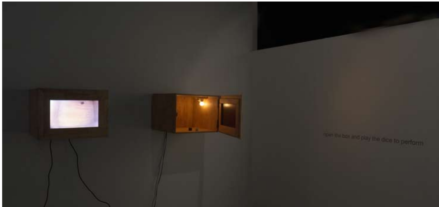
Grasp, wooden boxes, screen, camera, assorted objects, C++ code, 2012

We are talking of scales which do not have any markings. Scales which are not imposed but are discovered to be existing. The discovery of each such scale is either becoming a part of a weave we call truth or adding to the violence and disarray of our confusion. That is the pendulum we must swing on.