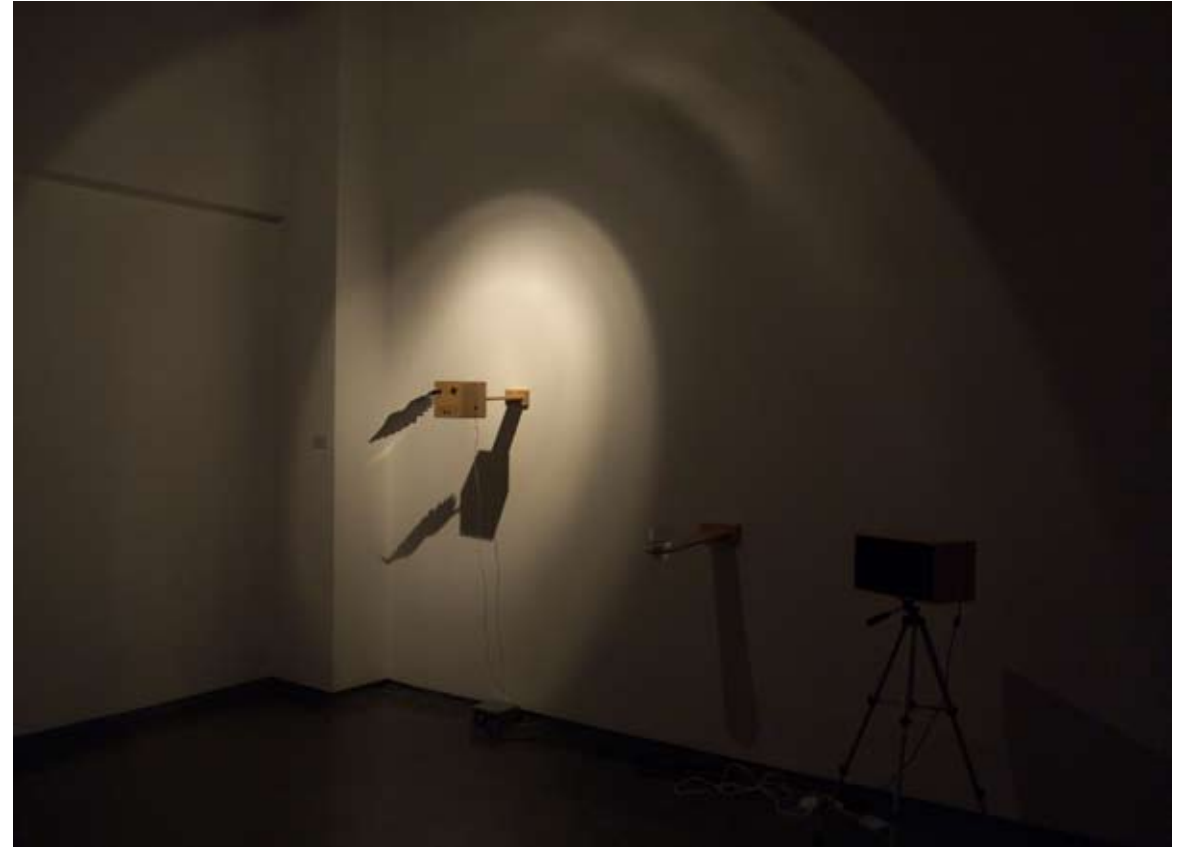
The Restoration, motors, acrylic, rubber, wood, glass, water, LCD screen, animation, 2012